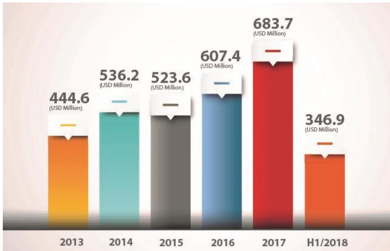
Total revenues (USD millions)