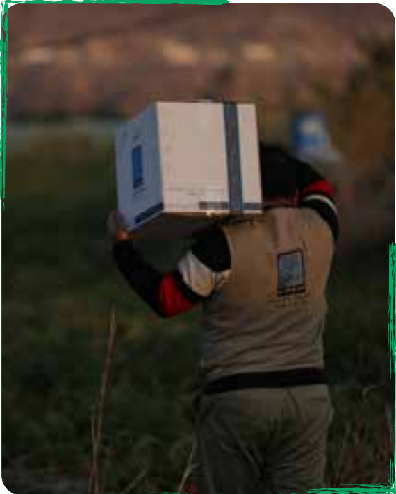
Um Tamam - A beneficiary of Tkiyet Um Ali’s Monthly Food Parcels (Sustainable Food Aid Program)

“Had it not been for Tkiyet Um Ali, we would have been in a difficult situation, and my kids would have all had to leave schooling to secure something to eat.”